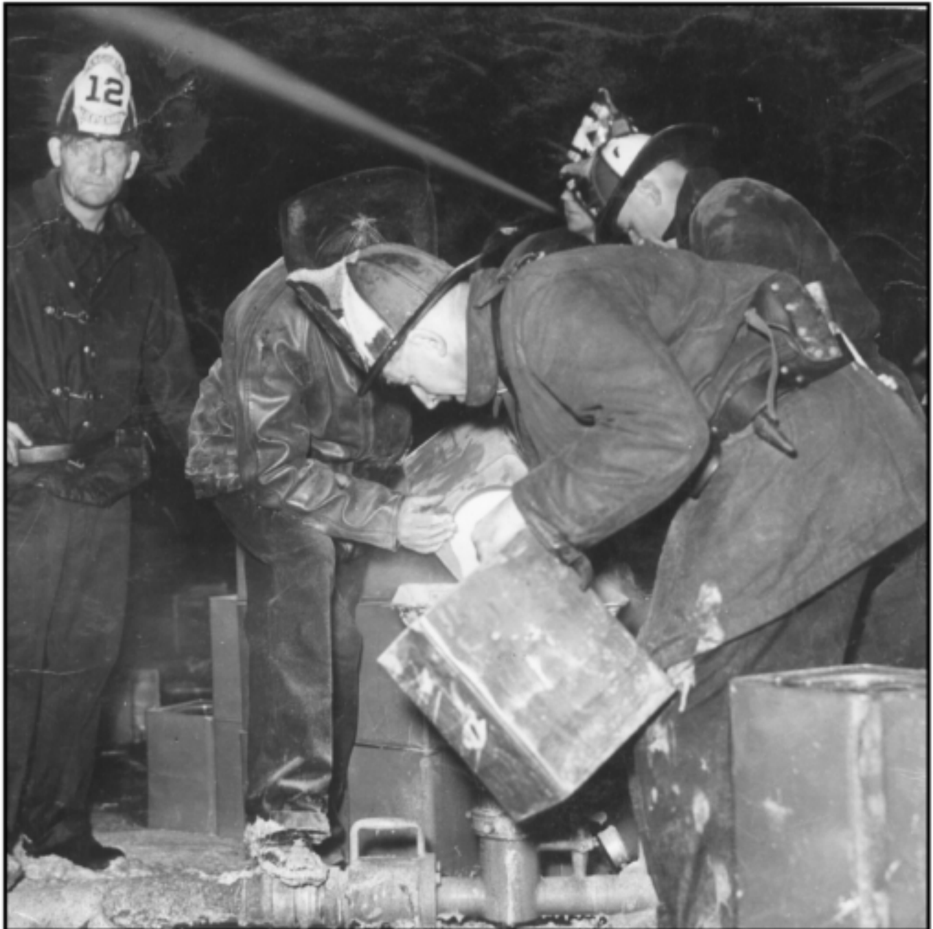
5TH ALARM - 8TH STREET AND HOOPER STREET STANDARD OIL COMPANY - SEPTEMBER 22, 1937

This section is dedicated to all the retired members of Local 798, who worked many long hours to maintain and improve the working conditions and benefits enjoyed by all San Francisco Fire Fighters. Retirees' efforts established a solid framework of working conditions and benefits for active members to build upon.. Let us never forget . .