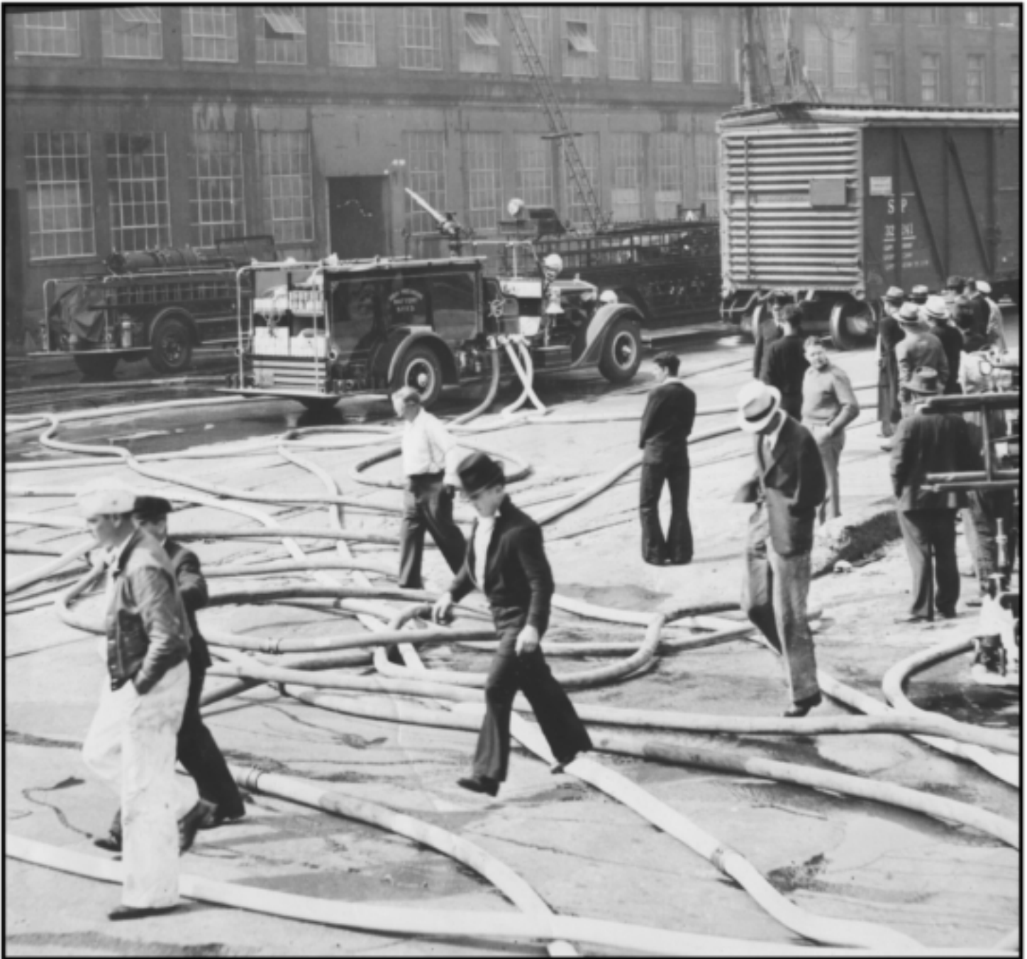
3RD ALARM - 17TH STREET & TREAT STREET APRIL 1, 1938

This section is dedicated to all the retired members of Local 798, who worked many long hours to maintain and improve the working conditions and benefits enjoyed by all San Francisco Fire Fighters. Retirees' efforts established a solid framework of working conditions and benefits for active members to build upon.. Let us never forget . . .